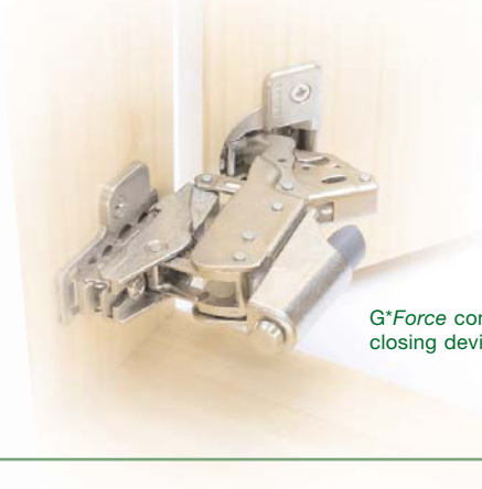
G*Force controlled closing device